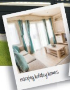
relaxing holiday homes